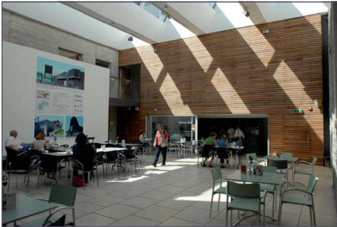
Model Niland Atrium Cafe

creation prospects, and which best encompass and demonstrate appropriate urban design, innovation, appropriate scale and cost effectiveness.