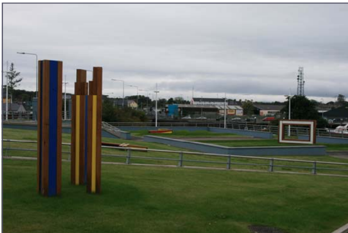
Recently Installed sculptures at the Salmon Point Amenity Area

and funded by the Department of Environment, Heritage and Local Government Per Cent for Art Scheme. The commission marks the delivery of the Sligo Waste Water Treatment Plant officially opened in May 2009.