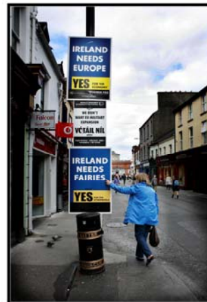
An alternative to the Lisbon Treaty Campaign on Culture Night in Sligo