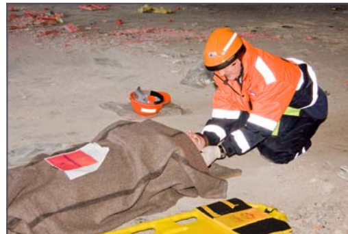
Civil Defence County Exercises

other commitments they had to decline these requests but these dates have now been pencilled into next years calendar. Events like these give the volunteers a high profile of capability to respond.