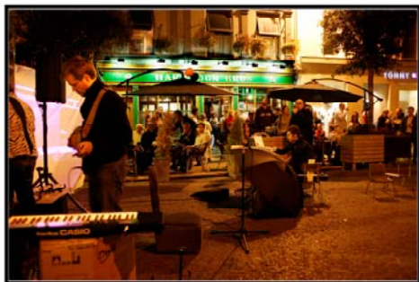
Musicians Perform on O'Connell Street during Culture Night

Sligo's first Culture Night on Friday 25th September introduced kids and adults to the richly varied world of modern and contemporary art in Sligo. A wide range of wonderful events took place all over town, for all ages and it was all for free!