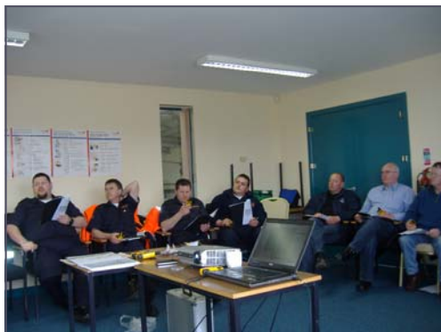
Sligo Civil Defence Members attend GPS Training

Aid / Ambulance cover for all Sligo Rovers home games which has now become a standing order in our yearly calendar. The volunteers are delighted to be recognised in high regard by the Rovers management to want their continued services year on year. This duty is a great challenge and the experience to be gained is immeasurable. The team on duty have been called upon on a number of occasions to deal with different situations.