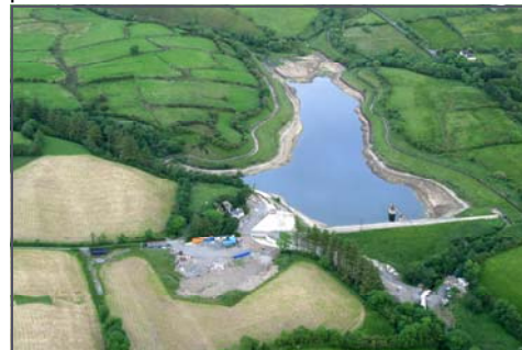
Kilsellagh Empounding Reservoir

Sligo County Council is currently awaiting the granting of loan approval from the Department (DEHLG) to meet the Councils contribution to the cost of this DBO contract. Immediately on receipt of loan approval Sligo County Council will be in a position to sign the contract and proceed to the construction phase.