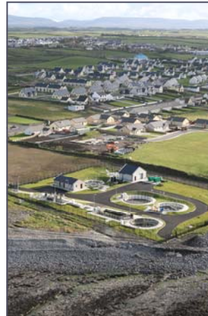
L - Recently opening Wastewater Treatment Plant in Enniscrone