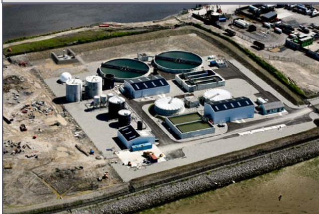
Recently Completed Sligo Main Drainage Wastewater Treatment Plant

This programme of investment in Water Services is much needed, however it does pose significant challenges for Sligo County Council, in particular the funding required for the non-domestic marginal cost element of capital projects. Similarly, the costs for operating and maintaining these modern new facilities to the highest standards will increase their annual budgetary requirements. For example the estimated Operation and Maintenance costs for Sligo Main Drainage and the Enniscrone bundle, in 2009, are almost €2M. Nonetheless, Sligo County Council is committed to working with all stakeholders in order to deliver this programme in a cost effective and