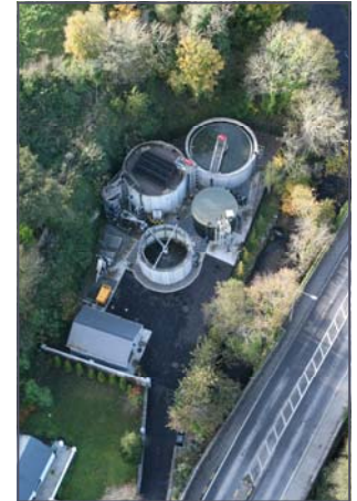
R - Wastewater Treatment Plant in Dromore West