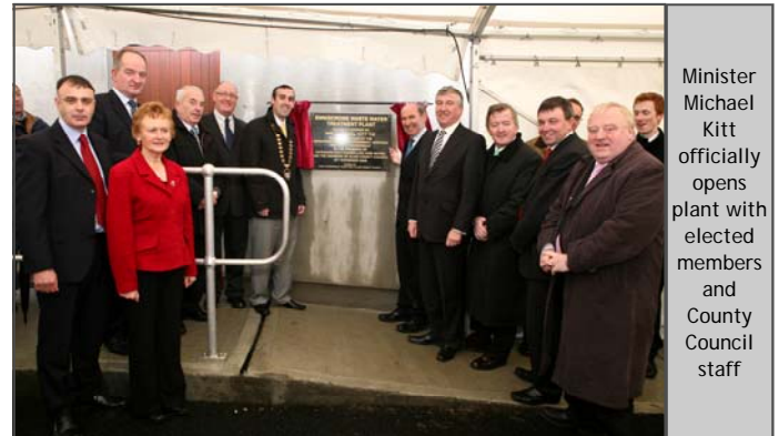
Minister Michael Kitt officially opens plant with elected members and County Council staff

He outlines the governments' commitment to new water and sewage schemes with a 19% increase in funding over the current year which will allow many towns and villages throughout Ireland to benefit from improved water services. He goes on to say that 'against the present economic backdrop this is the clearest possible statement by the government of the priority we are giving to preserving and protecting our water resources and providing critical infrastructure..' Minister Kitt concluded by commending the cooperation of the council staff, elected members, local residents and the contractors in delivering this project and declaring the Enniscrone plant officially open.