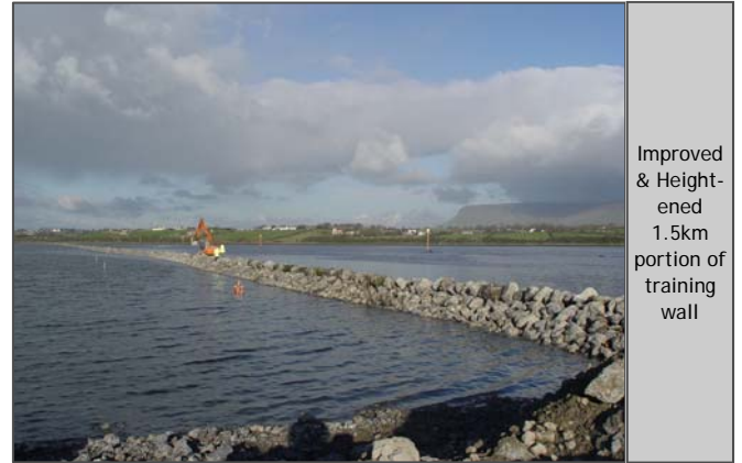
Improved & Heightened 1.5km portion of training wall