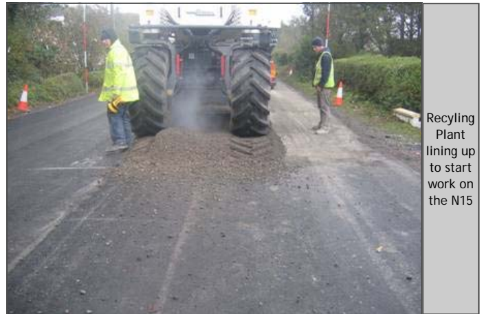
Recycling Plant lining up to start work on the N15