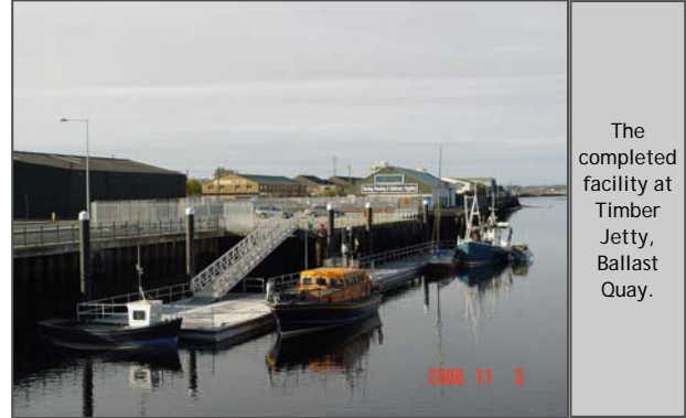
The completed facility at Timber Jetty, Ballast Quay.