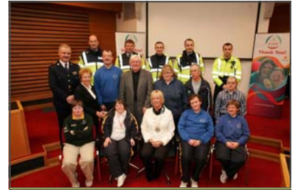
Sligo Fairways Golf Club