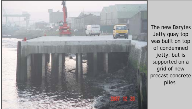
The new Barytes Jetty quay top was built on top of condemned jetty, but is supported on a grid of new precast concrete piles.