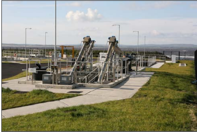
New Wastewater Treatment Plant in Enniscrone

Sligo County Council delivered the latest development of its county's waste water treatment infrastructure with the official opening of a new state of the art treatment plant in Enniscrone recently. Local councillors and residents, Sligo