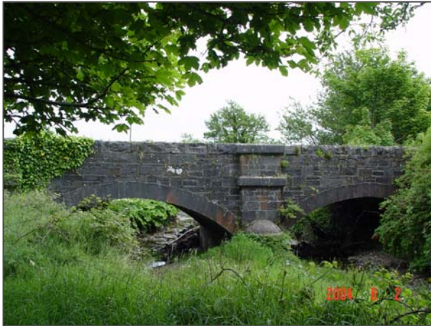
Belville Bridge - Dunniell River - Dromore West.

Maintenance work included removal of trapped debris and sediment, localised river training, de vegetation, minor masonry repairs and pointing, all essential work. The philosophy “a stitch in time save nine”, is used as much as the maintenance budget permits to maintain the public road bridge stock which forms part of our built heritage.