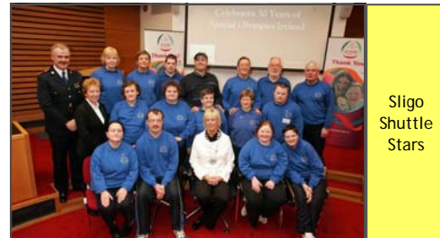
Sligo Shuttle Stars