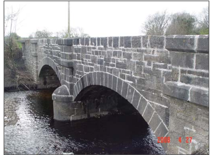
Restored Belville Bridge