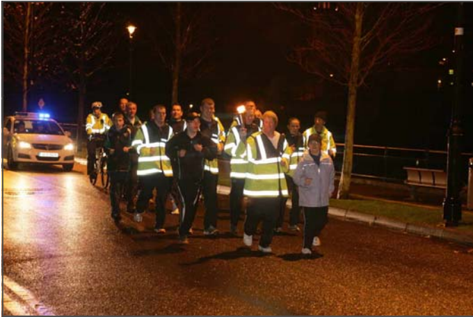
Special Olympic Athletes & Garda Volunteers participate in torch run to County Hall, Riverside

The Leas-Cathaoirleach talked of her personal involvement in the Special Olympics and the tremendous work carried out by the volunteers in Sligo and she wanted to take this opportunity to acknowledge this. Also, the participation of the athletes is equally important as 'they inspire us to want to be better and remind us the true essence of sports is indeed sportsmanship and participation.'